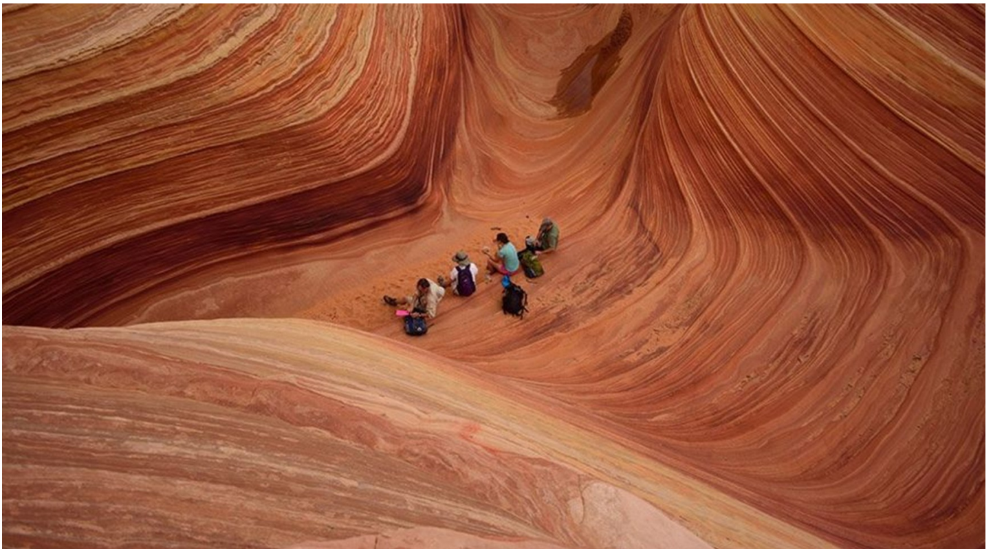
The Wave rock formation in Arizona, USA